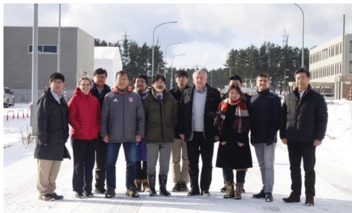
(Left) JET and samples of the plasma facing tiles. (Right) JA and EU experts in the joint analysis, 2019 Dec.

https://fusionforenergy.europa.eu/news/experts-measure-the-tritium-retained-inside-dust-particles-produced-in-a-tokamak/ https://www.qst.go.jp/site/press/41989.html